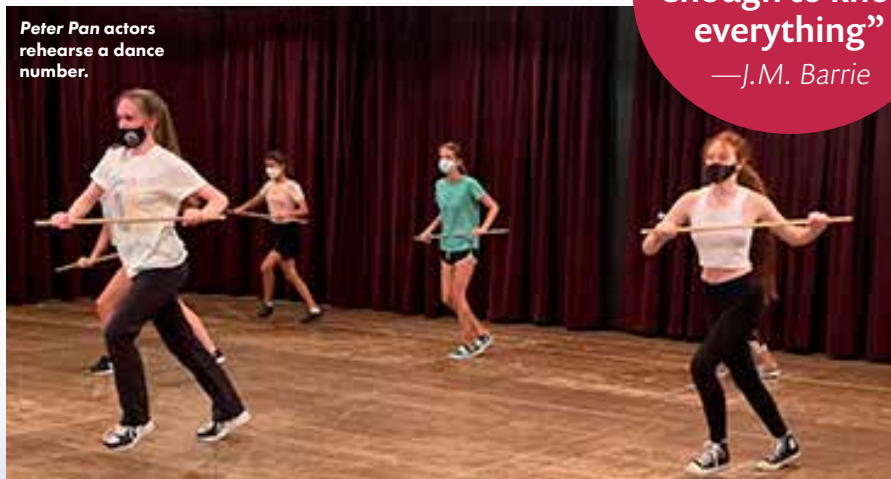
Peter Pan actors rehearse a dance number.